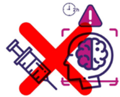
Many patients are not receiving brain scans or clot-busting drugs within the recommended time